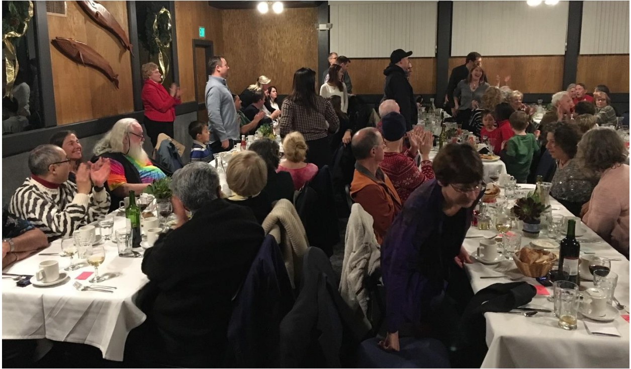
A round of applause as the newest Viking Probationary members are introduced.