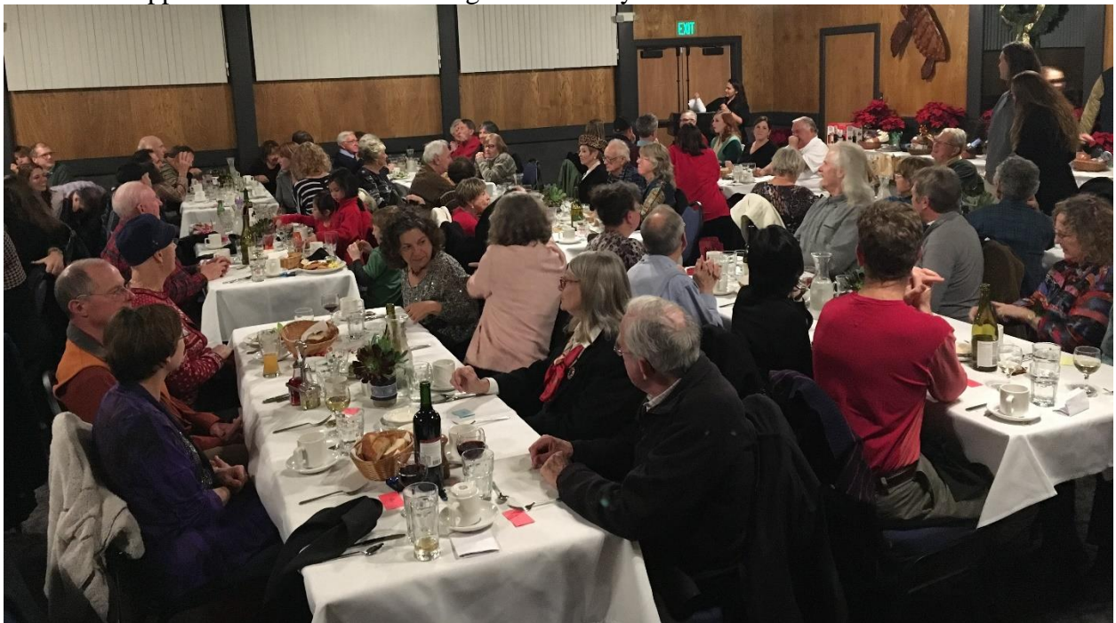
What a good looking group of skiers – all awaiting the arrival of Santa!

BOARD OF DIRECTORS - We still have 2 vacancies on the Board – won't you consider joining this fun group – we will take you for a one year stint, or you can join for 2 years.