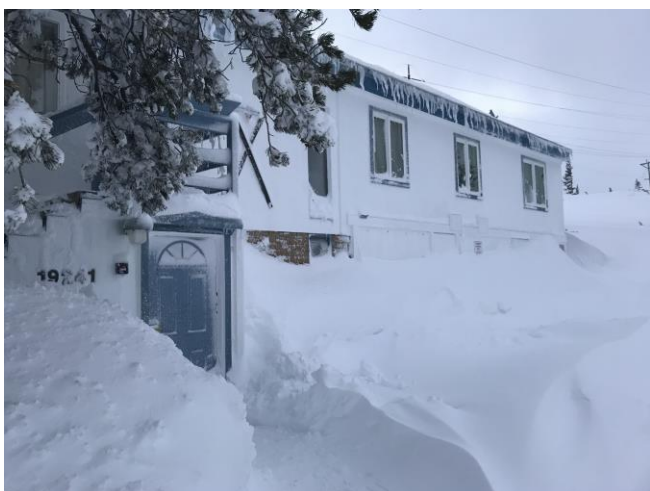
The morning after the Jan. 17 blizzard